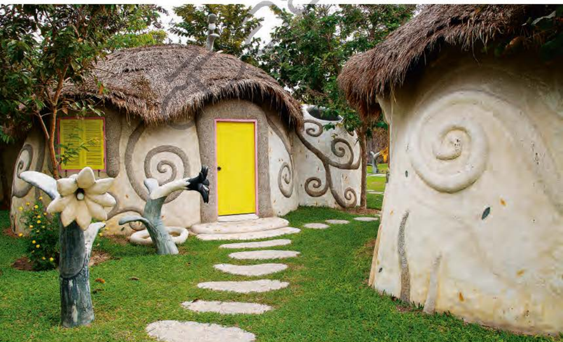
Vic Hua Hin