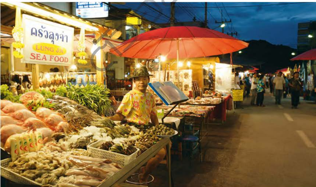
Hua Hin Night Market