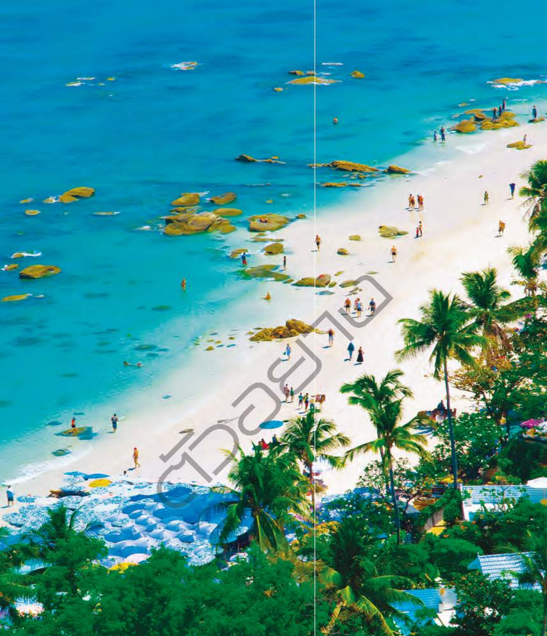
Hat Hua Hin