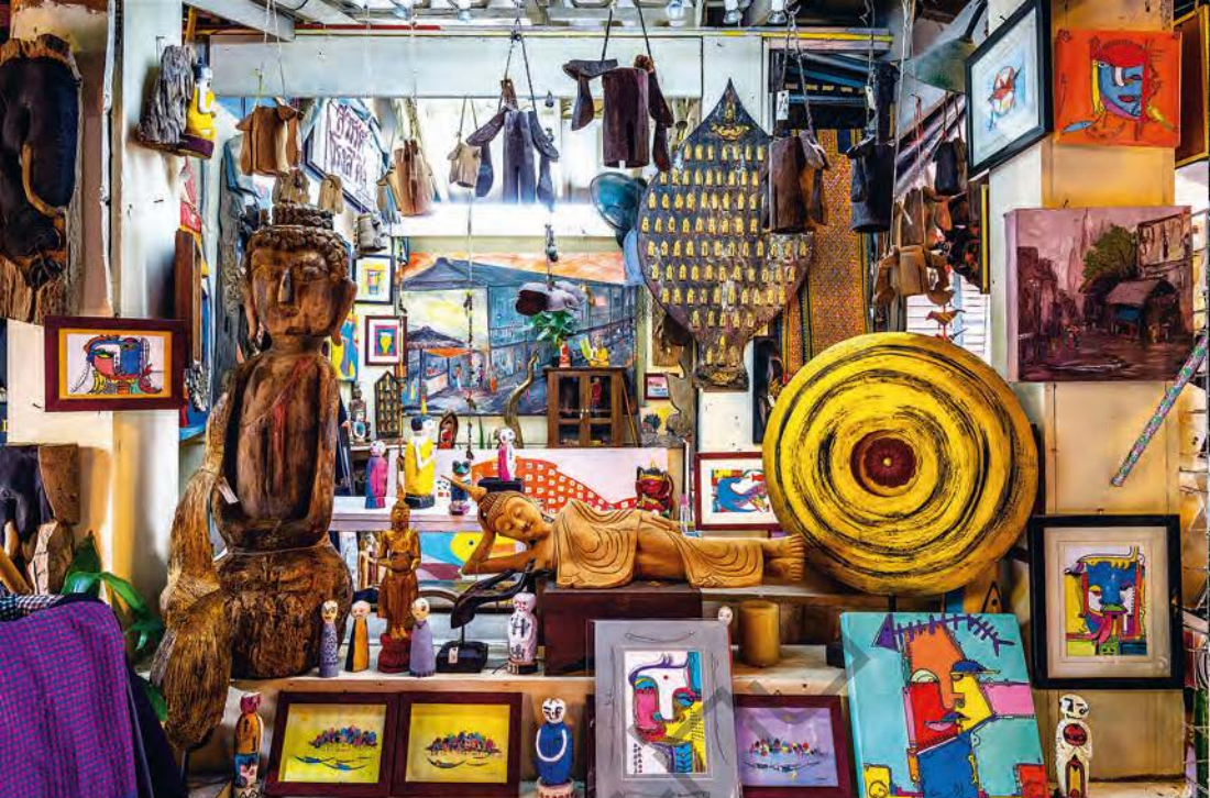
Baan Sillapin Hua Hin