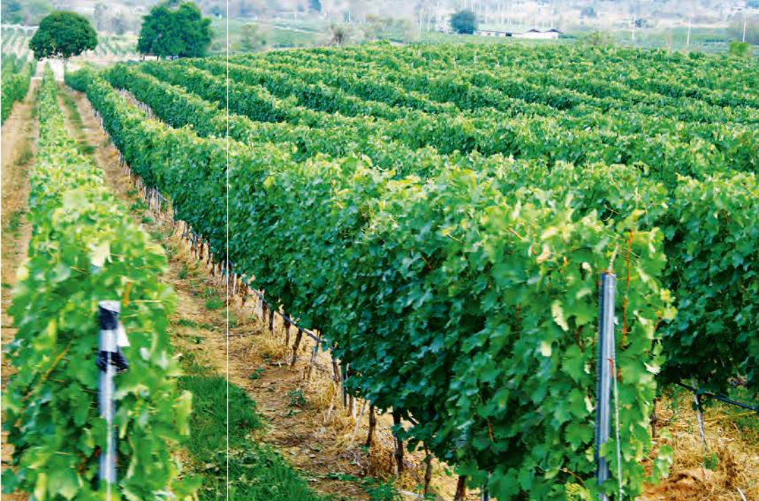
Hua Hin Hills Vineyard