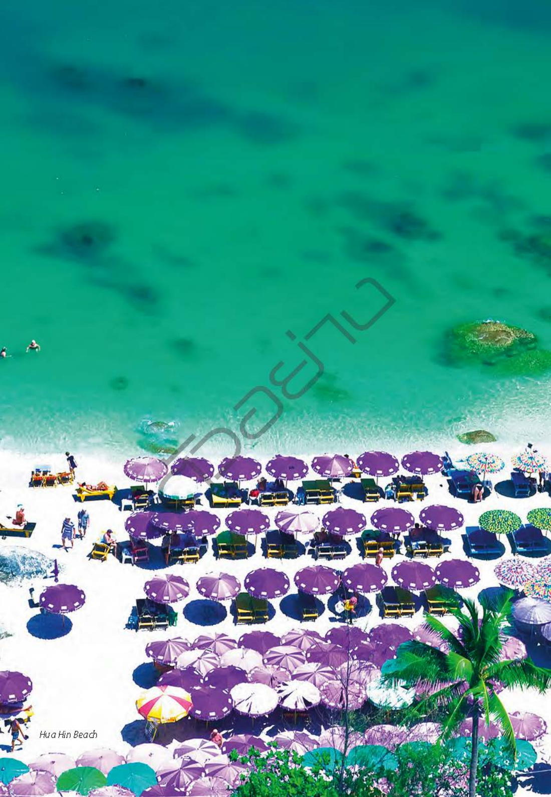
Hua Hin Beach