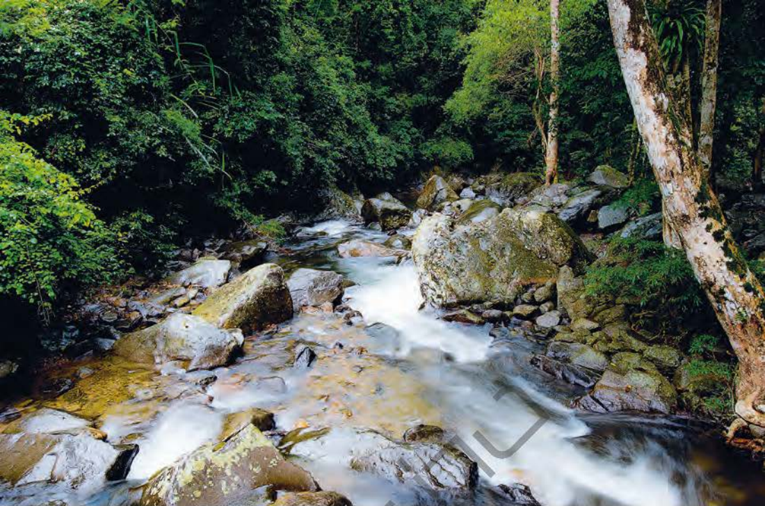
Namtok Pa La-u