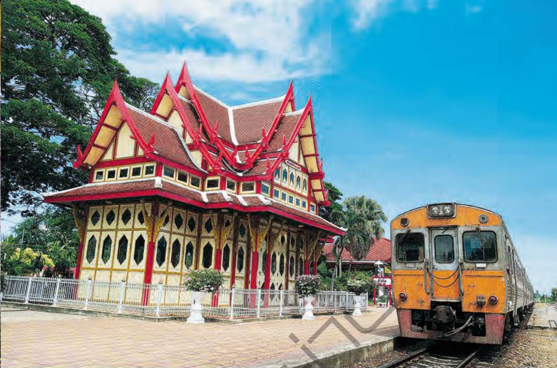
Hua Hin Railway Station