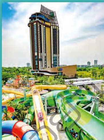
Lana Nava Hua Hin Water Park, Prachuap Khiri Khan