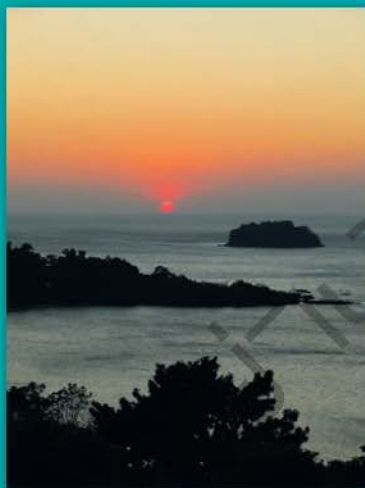
Kai Bae Viewpoint