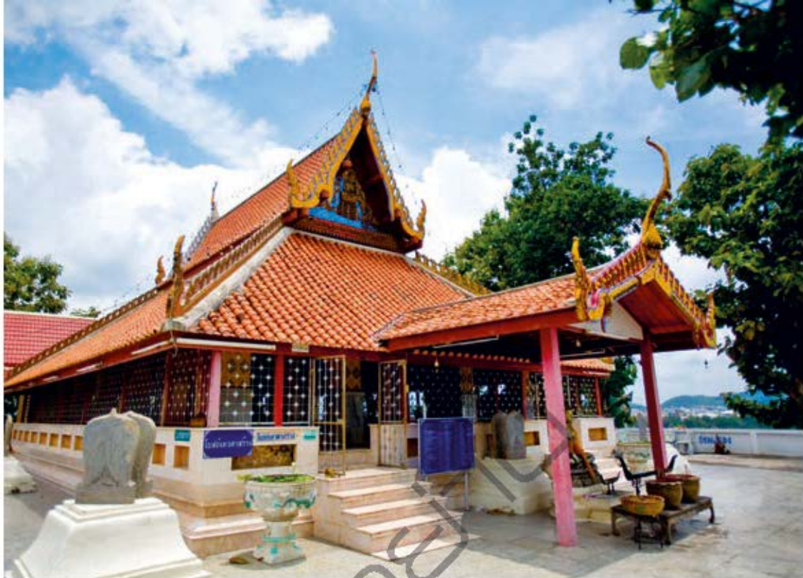
Wat Chom Khiri Nak Phrot

500 Baht. The boat cruises along the lake to Ko Lat. The return trip takes about one hour. The boat service is available from 09.00 a.m.-05.00 p.m. A morning cruise from 08.00 a.m.-09.00 a.m. has a good chance to see birds. For more information, contact the Bueng Boraphet Freshwater Fishery Development Station Tel: 0 5627 4501-3.