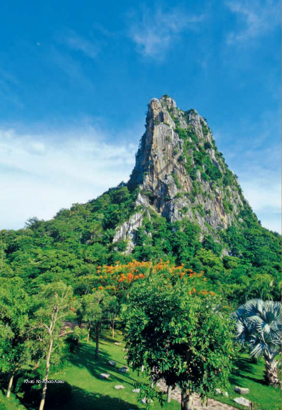
Khao Nbo-Khao Kaeo