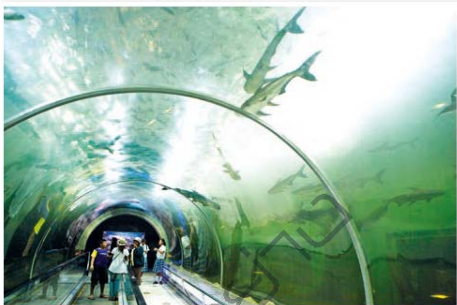
Bueng Boraphet Freshwater Aquarium built

Bueng Boraphet Non-hunting Area or Bueng Boraphet Wildlife Conservation Development and Extension Center, which is the birdwatching club of Nakhon Sawan. Tel. 0 5630 0040. Open daily from 08.30 a.m. to 04.30 p.m. or Bueng Boraphet Tourist Service Center. Tel. 0 5627 4524 www.buengboraphet.com .