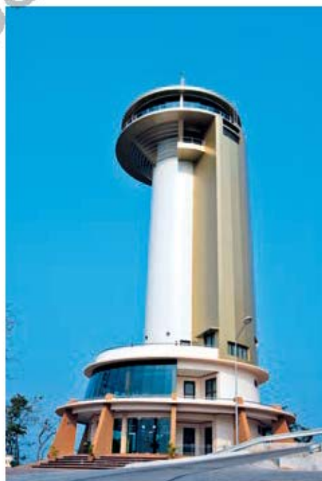
Nakhon Sawan Tower

is situated on the top of Khao Khiri Wong, Wat Khiri Wong. It is a tower 32 metres in height. Inside the tower consists of many facilities. The first floor is an area for public relations of