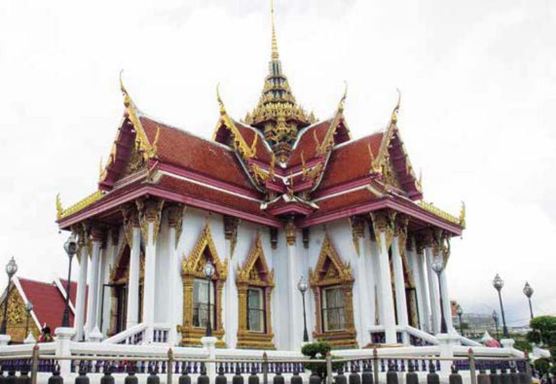
Wat Ton Son

in advance with an extra charge. A accommodation within the Cultural Centre is available in the form of the Thai Song Dam Style. For further details, please contact the Thai Song Dam Cultural Centre, Khao Yoi Municipality, Tel. 03256 1200 or visit www.thaisongdamkhaoyoi.com . To get there: By bus, take a bus on the Bangkok-Phetchaburi or Bangkok – Prachuap Khiri Khan route. Get off at the Khao Yoi Intersection and take a motorcycle for another 2 km.