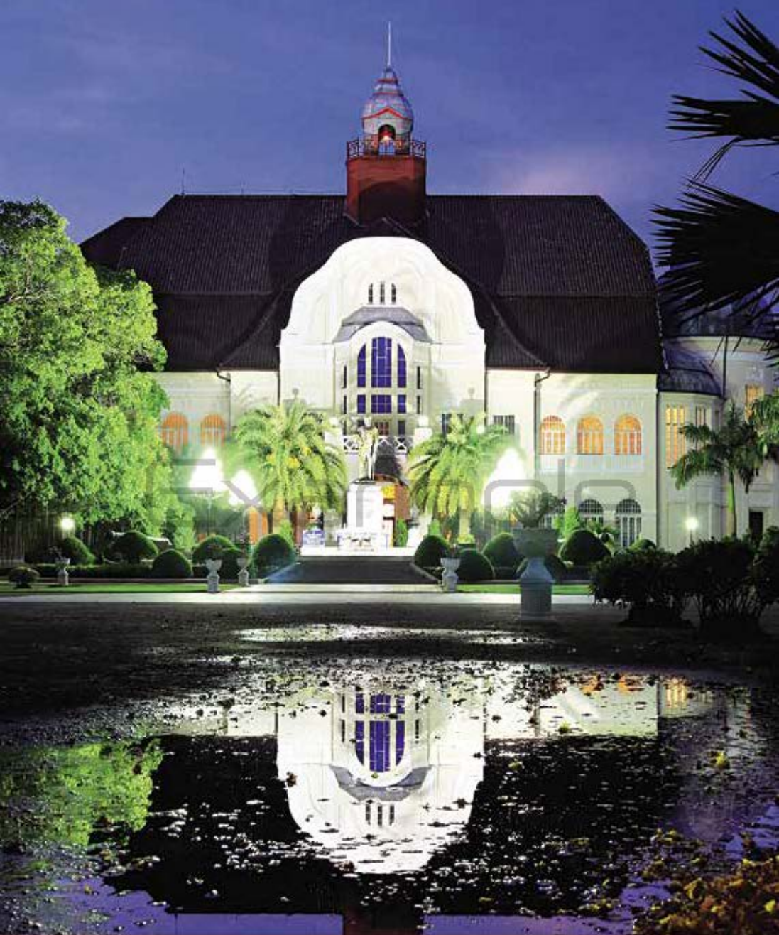
Phra Ram Ratchaniwet or Ban Puen Palace