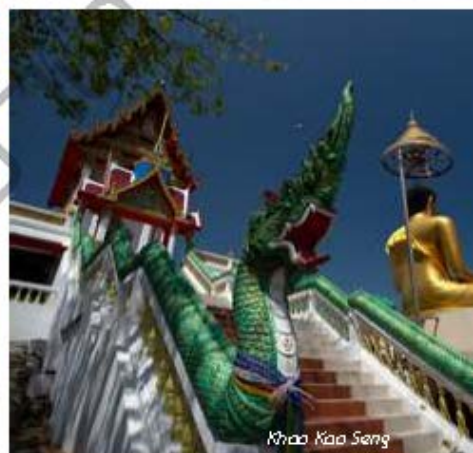
Khao Kiao Seng