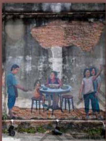
Sangkhla Old Town