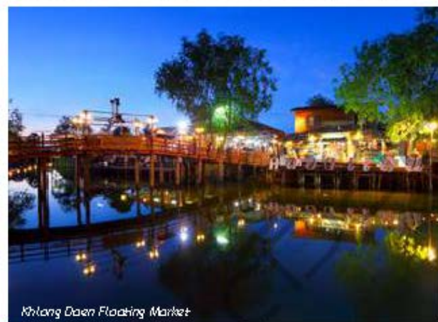
Khlong Daen Floating Market