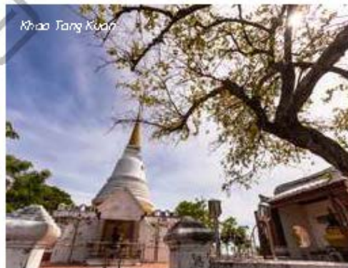
Khao Tang Kuan