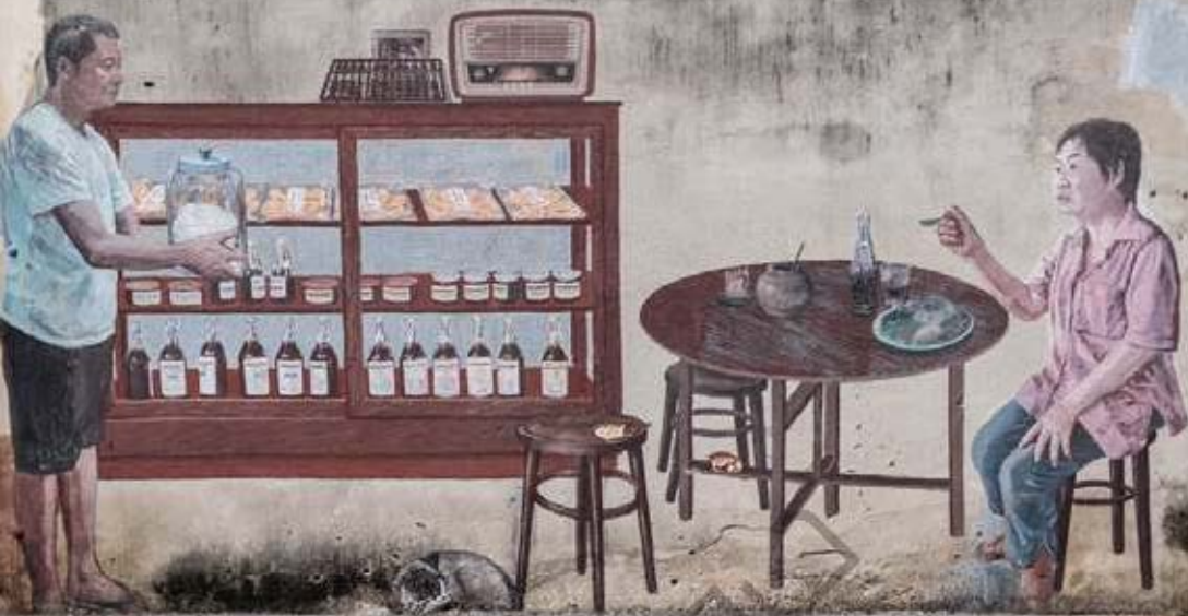
Songkhla Old Town